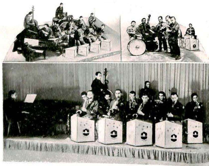
Typical Saturday night scenes of the Dance Band as they give out for the various clubs and organizations within the 142nd.