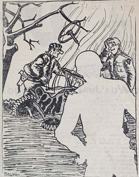
« Yes, I know... when in Rome do as the Romans do, but when in France do as... »